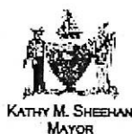
KATHY M. SHEEHAN MAYOR

CITY OF ALBANY DEPARTMENT OF FIRE AND EMERGENCY SERVICES 26 BROAD STREET ALBANY, NEW YORK 12202 TELEPHONE (518) 447-7879 FAX (518) 447-7883