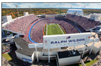
Stadiums, Arenas and other Venues Ralph Wilson Stadium (owned by Erie County)