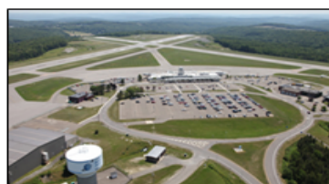
Transportation Greater Binghamton Airport