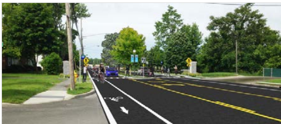
Completed Study: Delaware Avenue Complete Streets, Bethlehem, NY (2017)