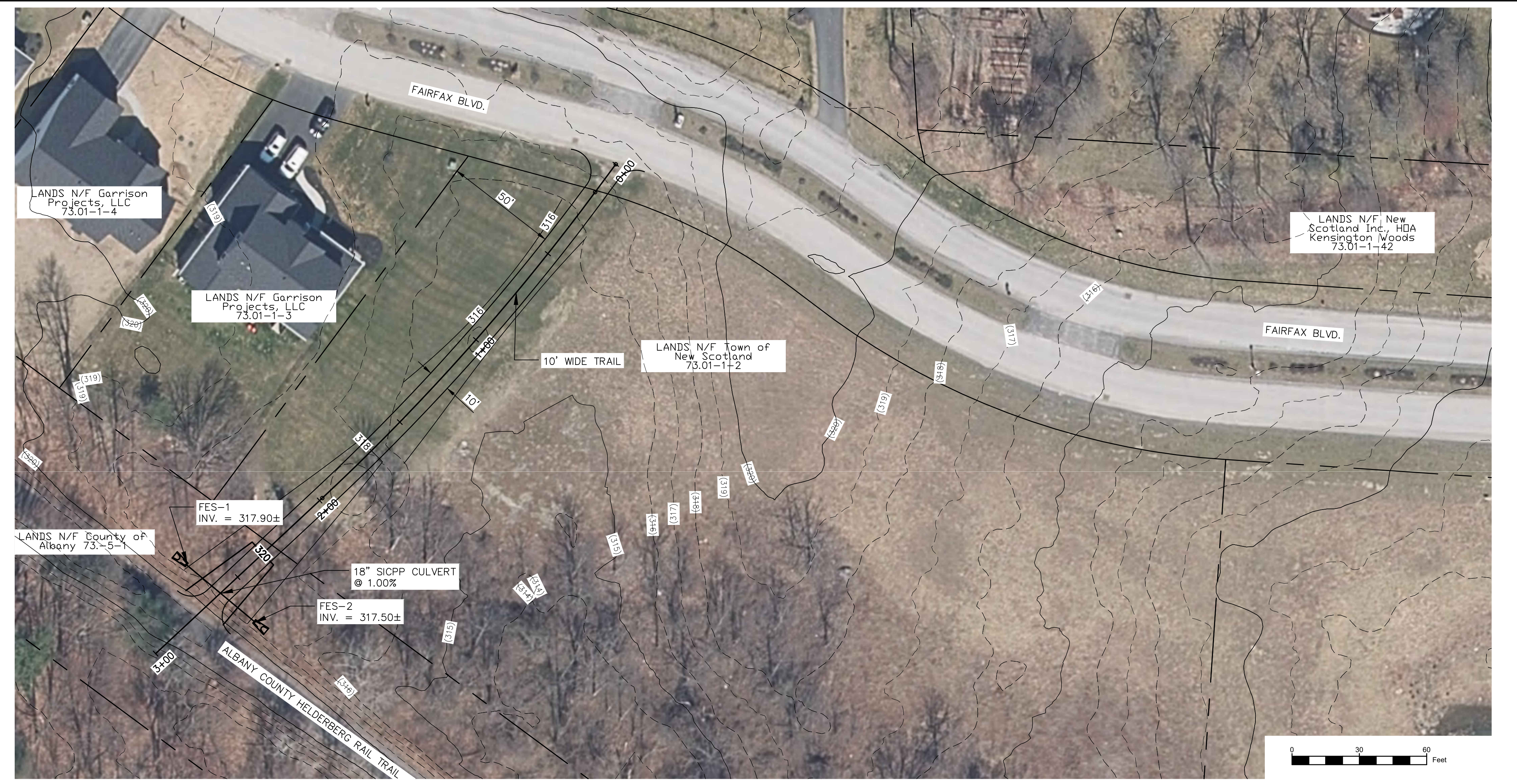
PLAN VIEW SCALE: 1"=30'