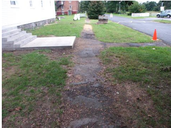
Asphalt walks at the Meeting House.