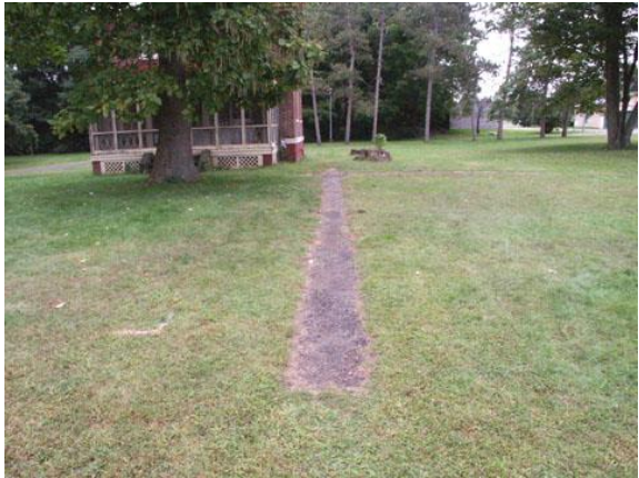
Asphalt walk leading to the Ministry Shop.

One crushed stone walk exists between Meeting House Road and the Ministry Shop. This walk is in poor condition owing to its uneven surface and weed infested edges.