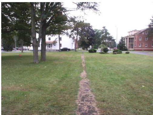
This crushed stone walk between the Meeting House and the Ministry Shop appears to be in alignment with the historic quadrangle stone paths.