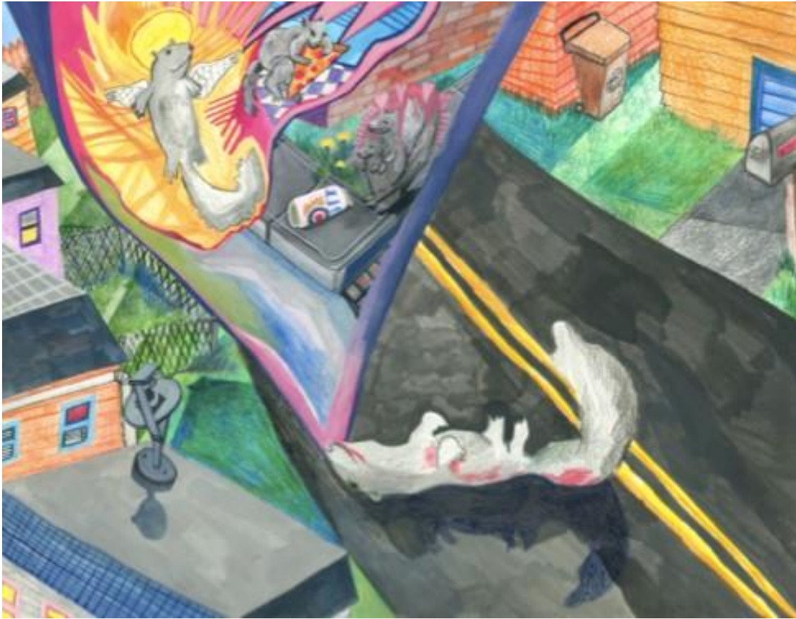
Life of a Squirrel, 8x10", gouache and watercolor on paper, 2020