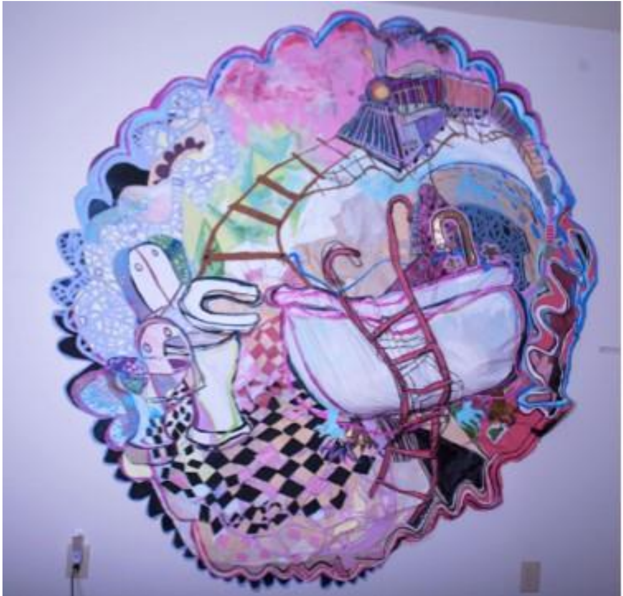
Untitled 1 , 8 feet in diameter, mixed media, 2015