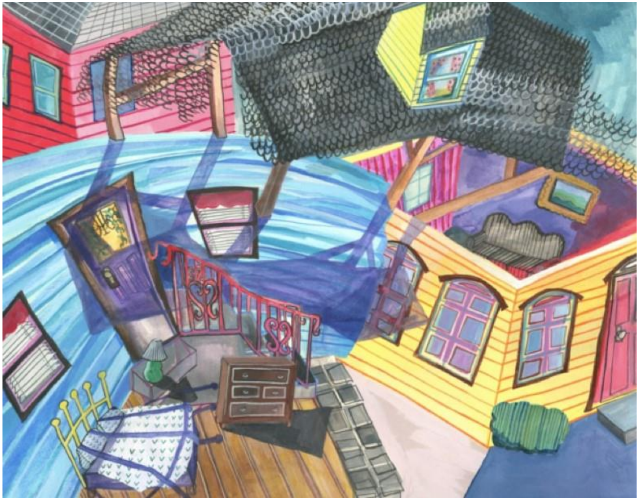
Bed House, 9x12", gouache and watercolor on paper, 2017