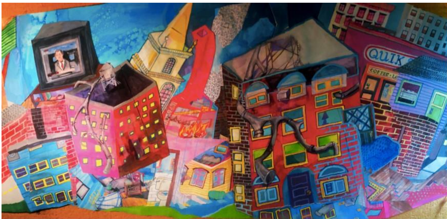
Sketch proposal (above) detail shot