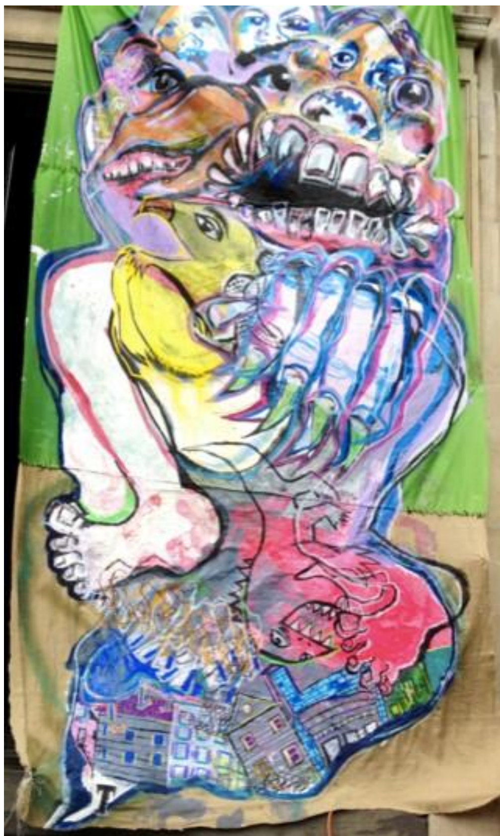
Public art mural at GrandStreet, 15x5', mixed media, 2013