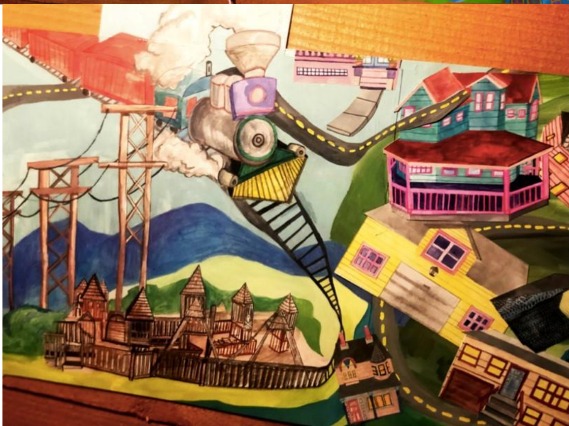
sketch proposal detail shot