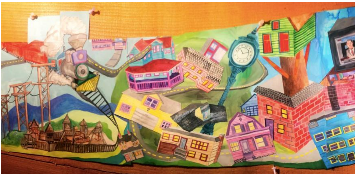
Sketch proposal for 4x8' mural, 48x12" (split into two parts to show details), acrylic, gouache and watercolor paint and glue on paper, 2020