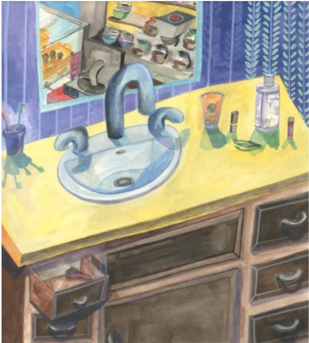
Birth of love, death of love, 8x9", gouache and watercolor on paper, 2017